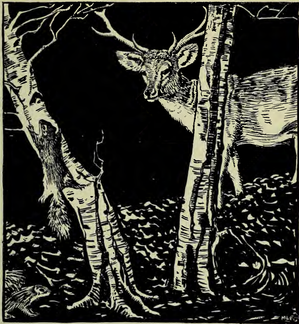
THROUGHOUT THE LONG WINTER MONTHS DEER LOOKED LONGINGLY FOR RAINBOW